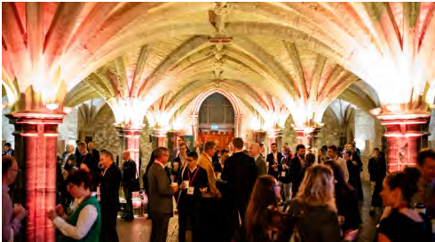
East & West Crypts