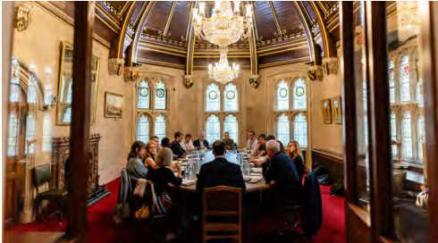
Chief Commoner's Parlour