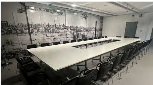
SBREC Elm Room