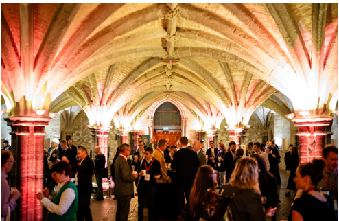
East & West Crypts