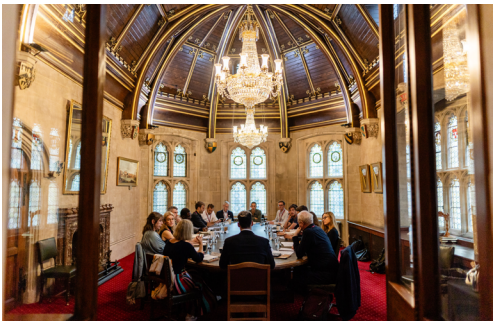
Chief Commoner's Parlour